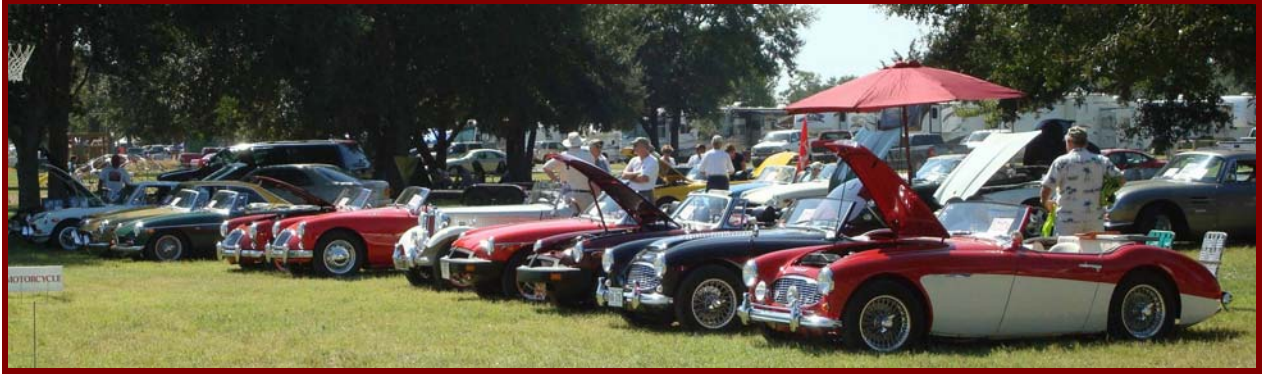
2008 Show Site on the Mississippi River

The show site will be just south of the River View RV Park and Resort overlooking the Mississippi River and is being held in conjunction with Vidalia's Jim Bowie Festival/Barbecue Dual http://www.vidalia.com/bowie.htm . The festival includes entertainment, crafts and food. There will be live entertainment throughout the weekend.