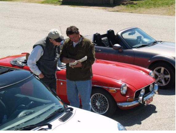
Some of us got lost. All of us were aware of it