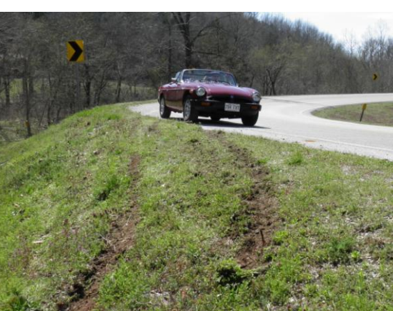
John ran off the road in a curve