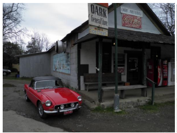
We ate the Best Burger in Oark