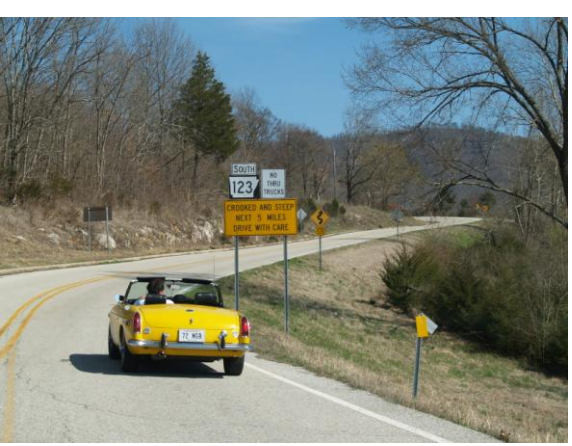
We drove some more fun roads