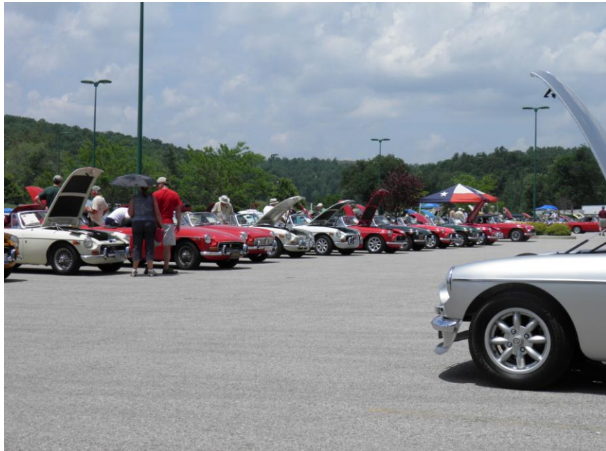
One of the "B" line-ups at MG 2014