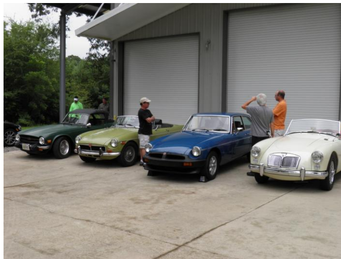
Drivers to Braxton kick a few tires and compare notes

Braxton, MS – Although the weather was a bit foreboding, on July 19, 2014 fifteen members and friends of the EMC departed from the Coffee and Cars gathering at Primos on in Flowood for the drive