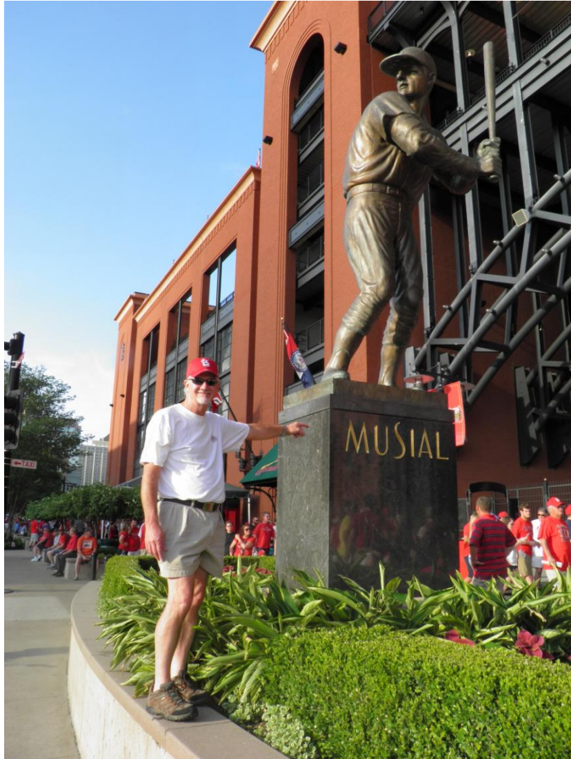
We managed to get closer to The Man than The Gateway

would be right on our return route home. We started Thursday's drive traveling along the back roads of Indiana. Our start was early enough that you could see the clouds of corn pollen rising up with the warming of the morning. We traveled west toward St. Louis primarily on state highway 50 stopping in Vincennes Indiana on the banks of the Wabash River for lunch and laundry detail before traveling to the highway construction area that surrounds The Gateway to the West. We arrived in construction zone, mid-afternoon, bumper to bumper traffic for about an hour and a half to traverse to arrive at The Missouri Athletic Club. As we pulled into the parking lot of I was sure that Ole Red's clutch had given up in