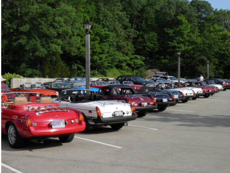
MGBs from most every state at Spring Mill