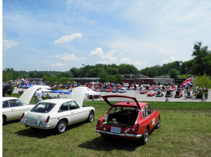
“C’s” on the hill at MG 2014

Show day, Wednesday broke clear with few clouds in the sky and the temperature rising into the high