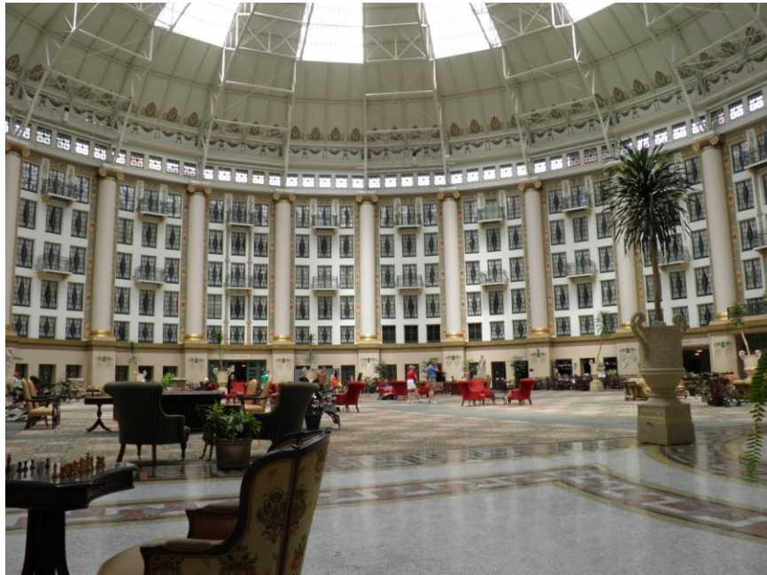
The magnificent West Baden Hotel Lobby

Monday thru Wednesday the NAMGBR and the host clubs, Southern Indiana Region British Car Club and Indiana Flat Land British Car Club made it difficult to sleep late with so many interesting activities to