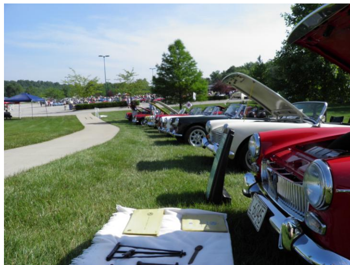
Line-up of Midgets

80’s. The “B” register was thoughtful in giving the grassy areas to the “C”s, Midgets and a few other decedents of the marque while the B’s were placed on tarmac that took in and reflected a lot of heat.