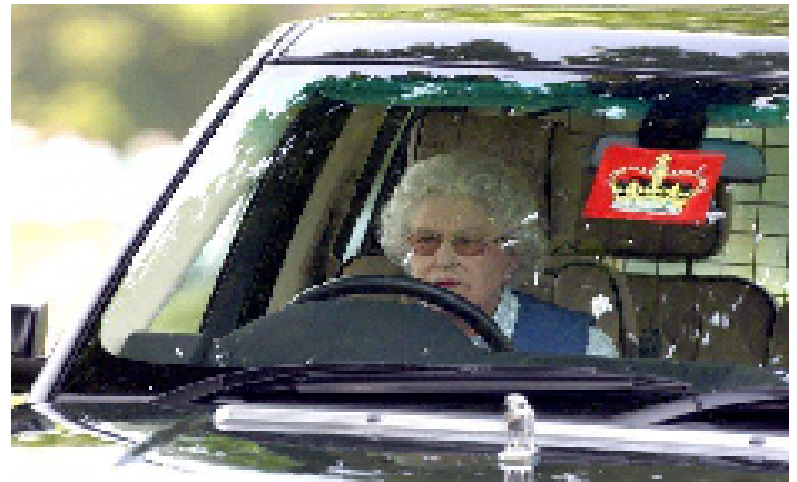
One never knows who might show up for Brits on the Bluff.