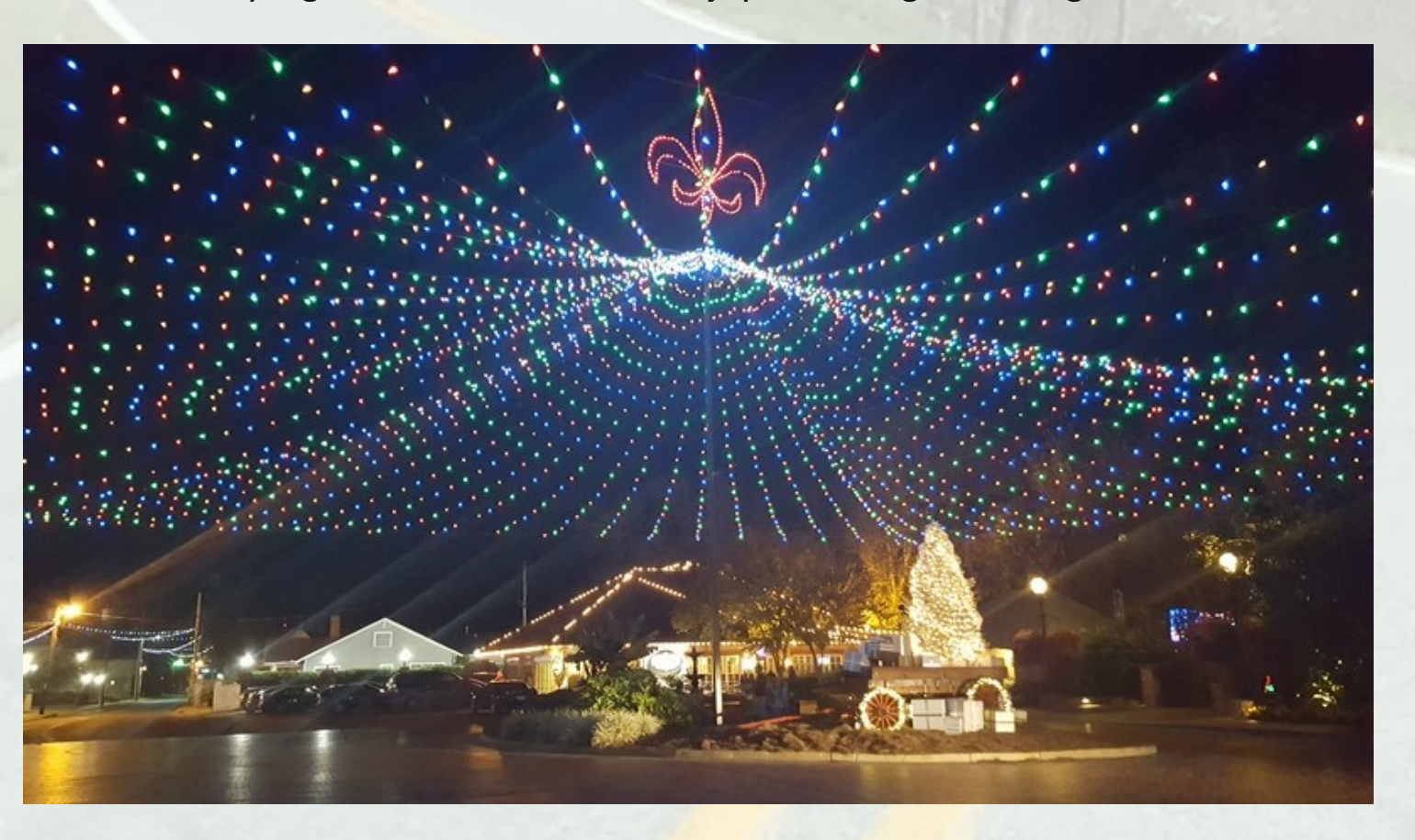
Natchitoches Christmas lights

The Christmas lights were on along the Cane River downtown. The walk along the river walk on Friday night was cool but much enjoyed. The lights were great.