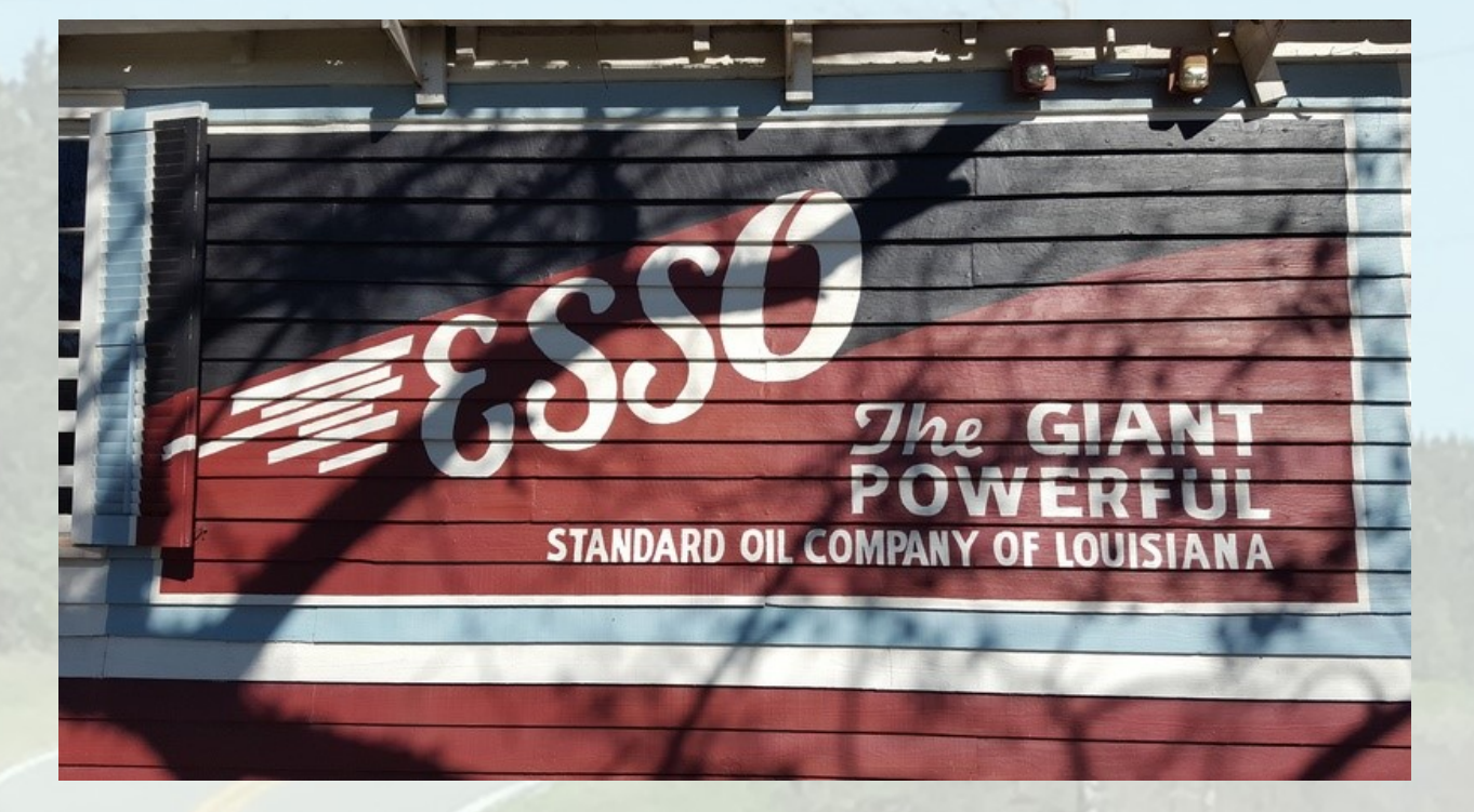
Esso sign from Oakland Store

The Christmas lights were on along the Cane River downtown. The walk along the river walk on Friday night was cool but much enjoyed. The lights were great.