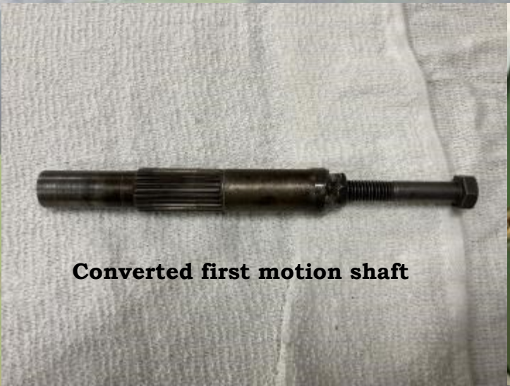
Converted first motion shaft