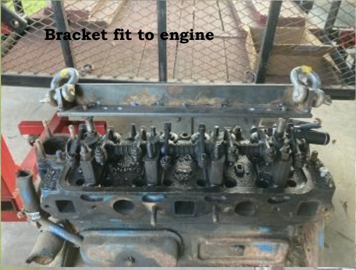
Bracket fit to engine