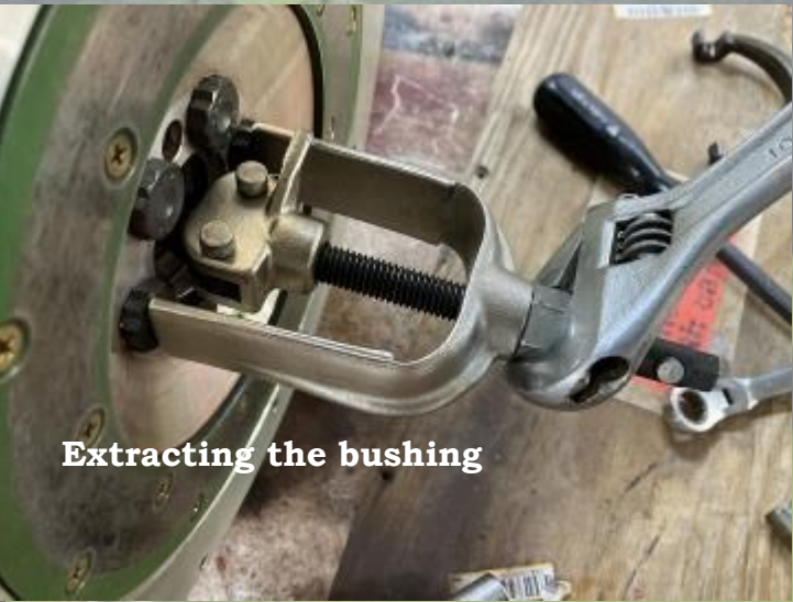
Extracting the bushing