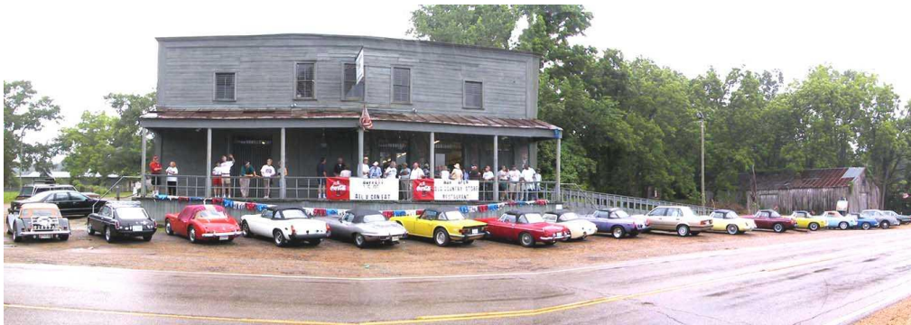
DTH 2001 at the Old Country Store

Now for a more recent snap shot. This one was taken at the start of the 2001 Drive Thru History. From the looks of the color coordinated blanket on the red Healey it must have started out on a wet note. Can anyone identify the cars and owners?