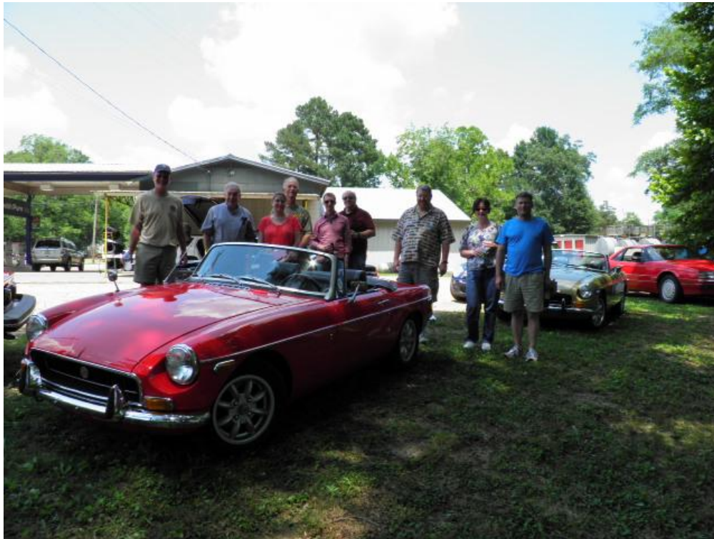
Made in the shade in Sebastopol

Following the visit to the museum we traveled thru Louisville to Lake Tiak-O-Khata for lunch. The buffet at Lake Tiak-O-Khata is on the EMC's must dine list whenever in the area and this visit was no exception. The restaurant was busy however due to Charlie's early planning they set us immediately and we dug in to the fine food and deserts offered. Following lunch we adjoined to the shade of the covered pier for a brief meeting.