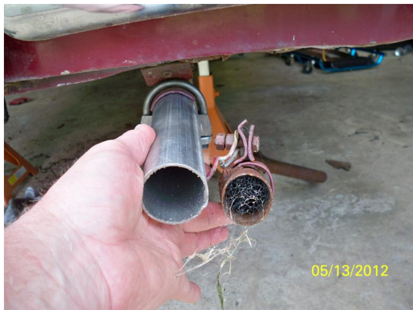
When size does matter

The exhaust piping to the back was straight forward once I got the piping twisted around under the transmission. An exhaust shop made up the tail pipe. The end result is an exhaust system that will let the exhaust escape.