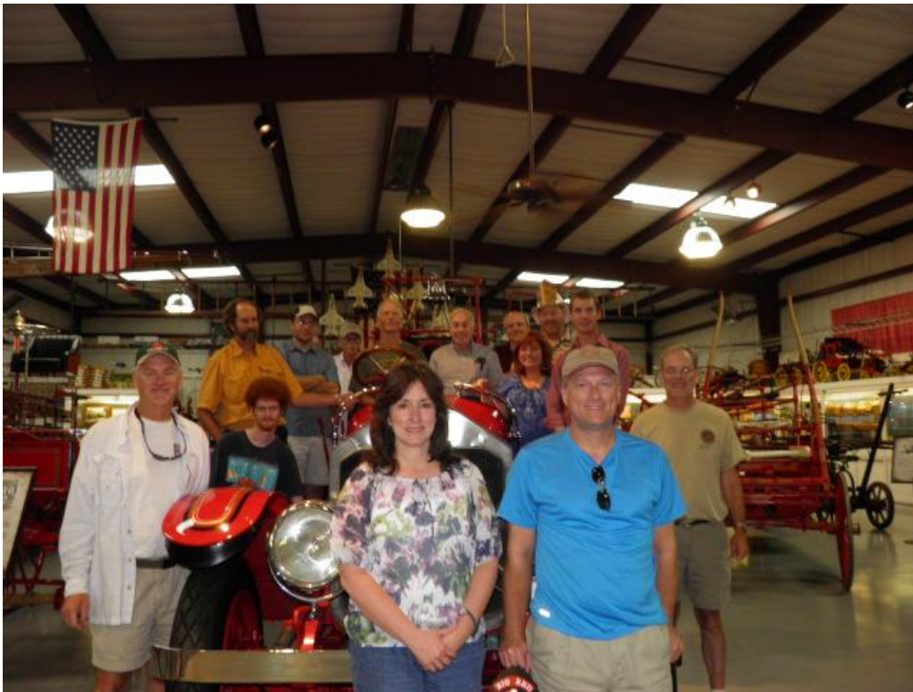
The EMC at Taylor Fire Truck Museum