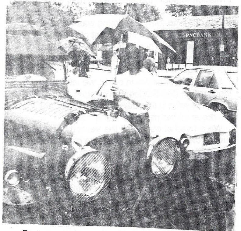
Barbara and some of the cars on the countryside tour