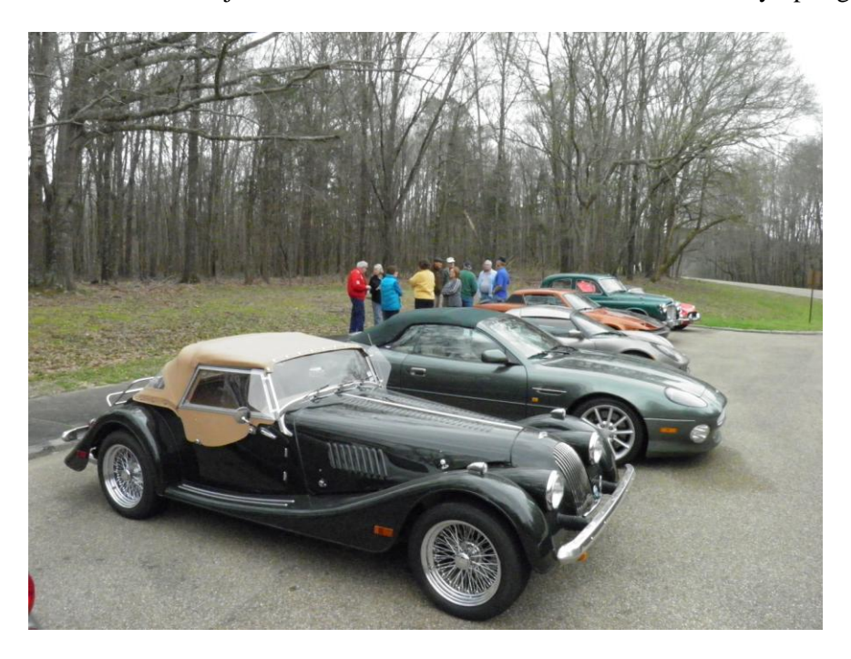
Gathering for drive to Tops Down 2014.

It's on the local calendar and I'll include in future OSU's and club notices. A total of ten cars made the 10:00am rendezvous on the Trace just outside of Clinton for the drive down to Rocky Springs. Although