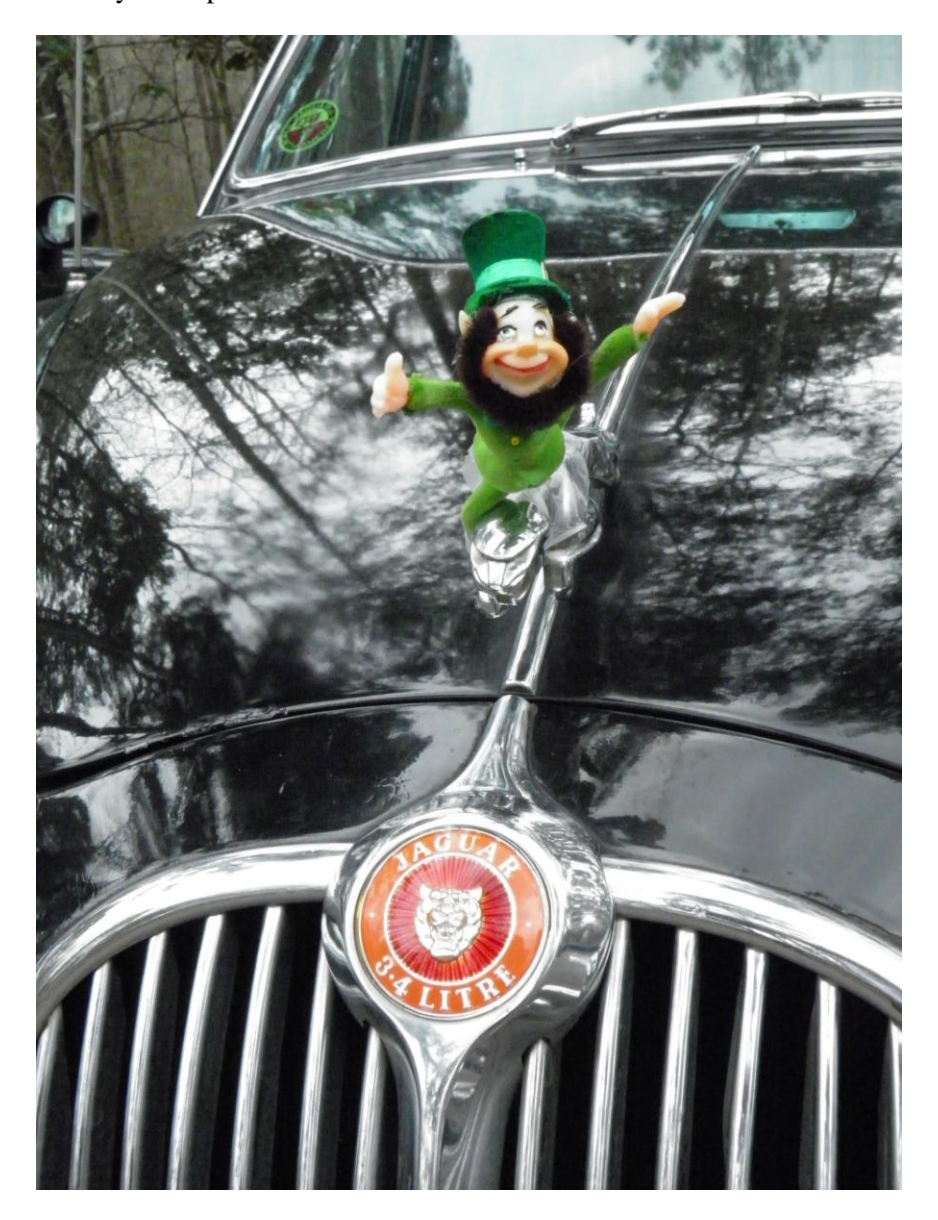
This Leprechaun arrived in style.

folk while the ladies lounged about under the trees. Why even a top or two were dropped in celebration of the coming spring, actually upcoming in five days. Cannot wait! With thoughts of brighter weather coming we broke camp and traveled home to close out another great gathering for the EMC. Thanks to all that contributed to a day well spent.