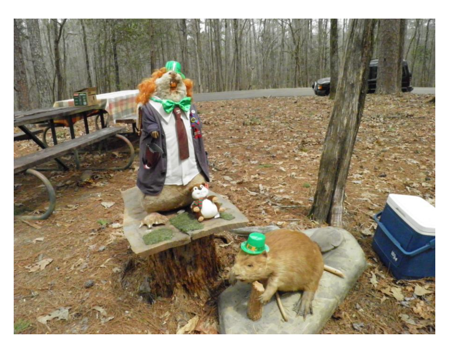
The Beavers dressed out in their green for Tops Down. Yes, they've multiplied!

prediction of rain by 2:00pm was way off the mark. We even got a few glimpses of sun during the afternoon. Food of course was present with many dishes prepared with the celebration of St. Patty's day in mind.