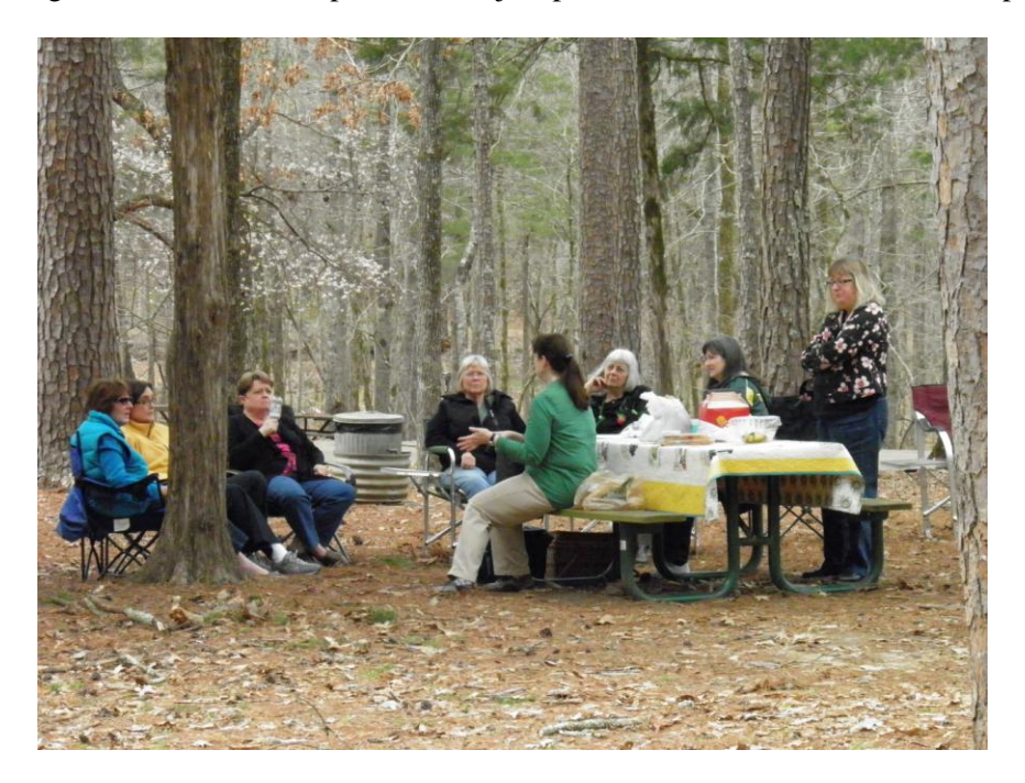
The ladies gathering at Tops Down.

camp in our usual location under the trees and greeted additional members until the group had grown to twenty-seven! A great turn out and in spite of, or in just plain disobedience of, the weather person's