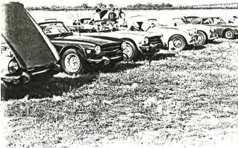
British Car Fest

were ever made - two plugs per cylinder!). The owner of the Aston Martin turned out to be a very interesting fellow; he had to leave his Maserati and Jaguar C-Type at home!