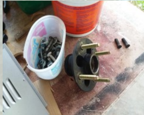
Hub with 4 new studs