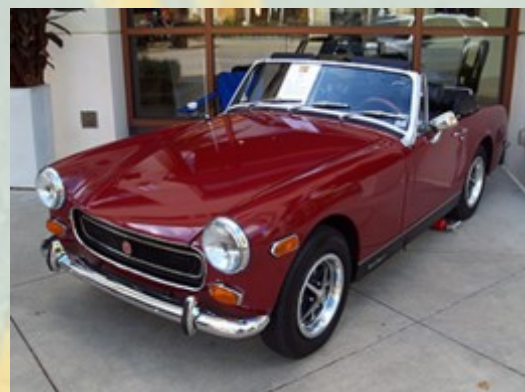
Preservation—Best in Class