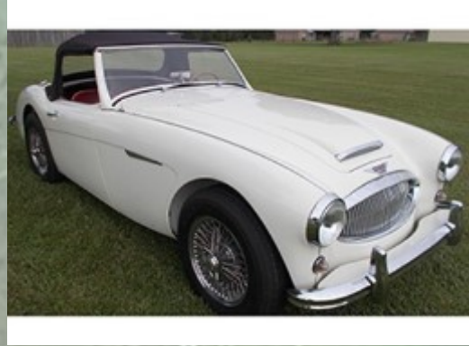
British Open—Outstanding in Class