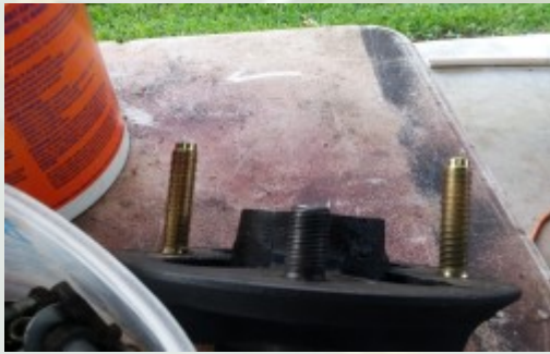
Hub with new studs installed