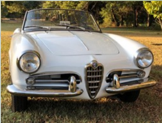
Italian Open—Best of Class