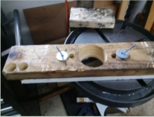
Drill fixture without hub studs