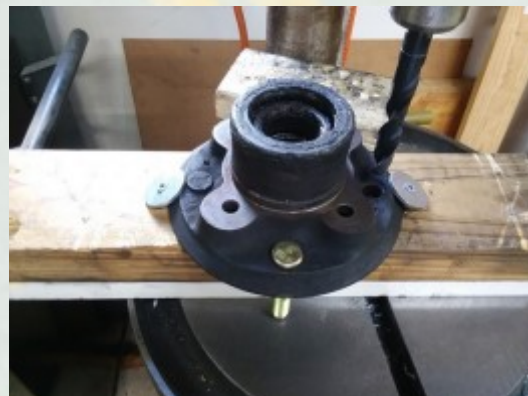
Drill Fixture with hub