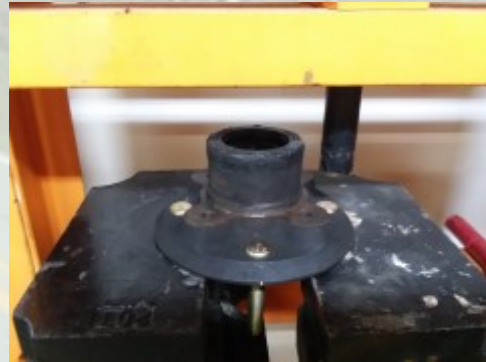
Pressing in new studs