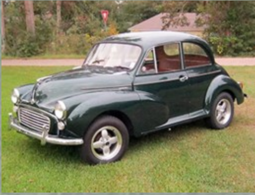
British Closed—Best of Class