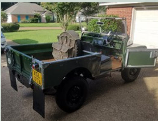
Outback—Outstanding in Class