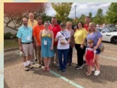
The Ed Wettach "Love of the Automobile" Award