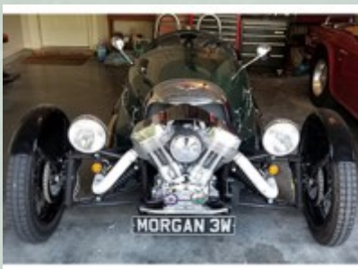
Best of the Renaissance Nouveau Award