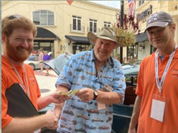
Is this Charlie Durning bribing the judges