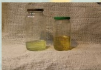
New gas in left jar, old gas in right jar

The next day I thought I figure that I had timing, spark, gas and rotation that the car should start. I was going to do a compression check when it hit me to give the gas a check. I drained about a pint out of the left tank into a glass jar (the Europa has two tanks cross connected). The car was about 1/2 full (about 6 gallons) and I had used Stabil the last time I filled it up. The gas was a slight brownish color with a odd smell. I got another jar and put some fresh gas into it to compare.