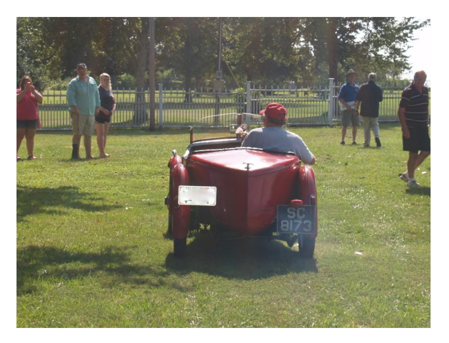
The 1930 "M" Type leaves BotB 2014

Thanks to all that made the trip and we hope that you'll put us back on your calendar for 2015.