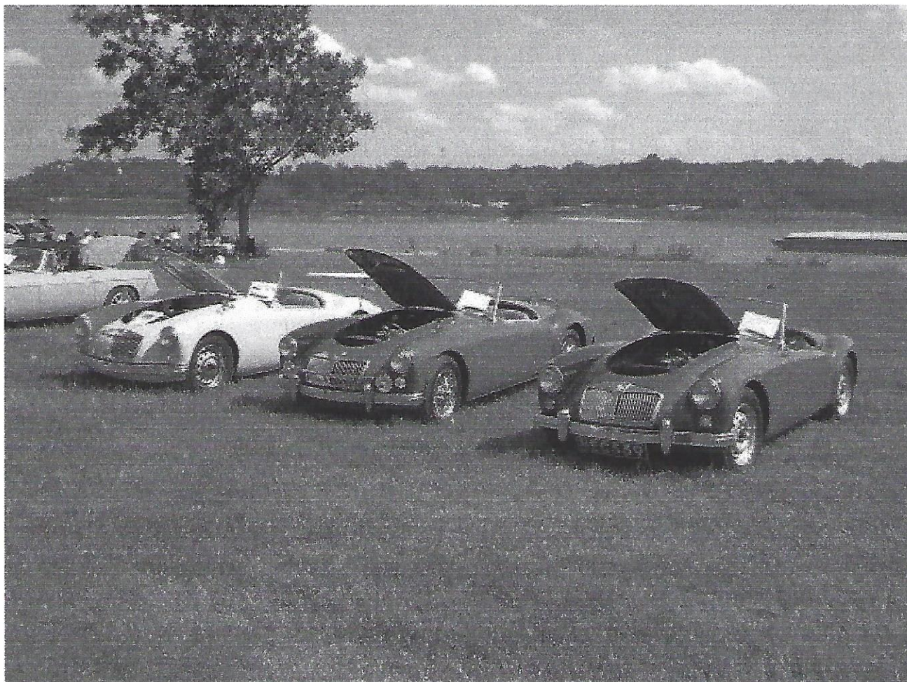
A triad of MG A's