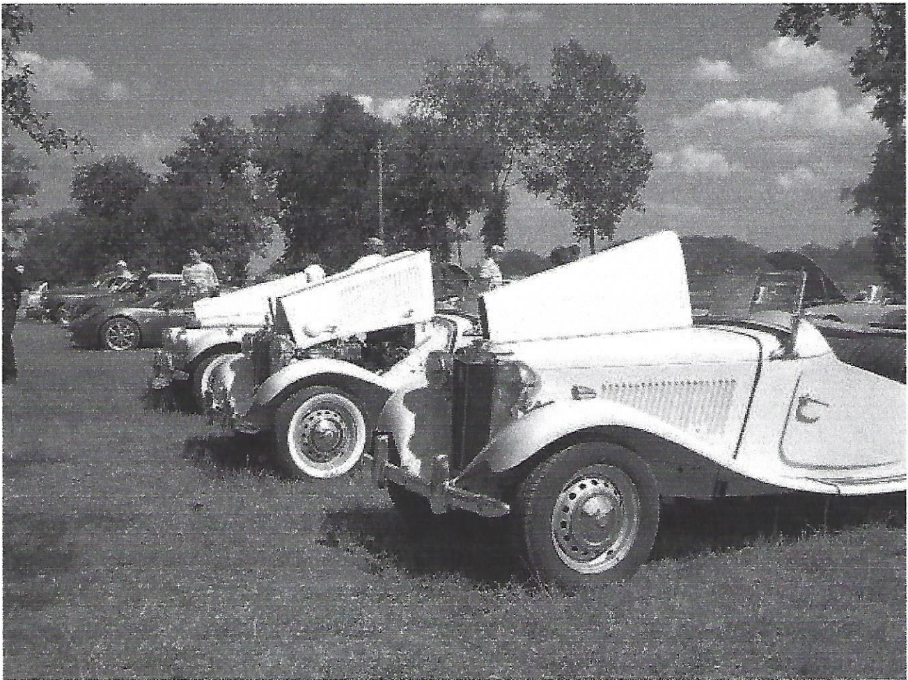
A triad of MG T's