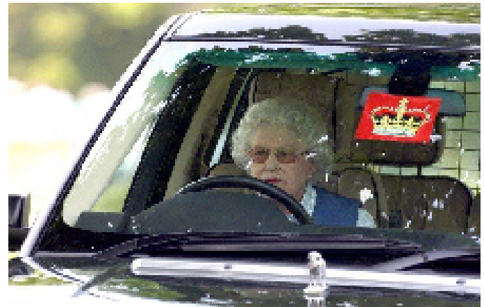
One never knows who might show up for Brits on the Bluff.