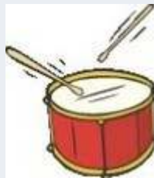
THIS IS A DRUM ROLL