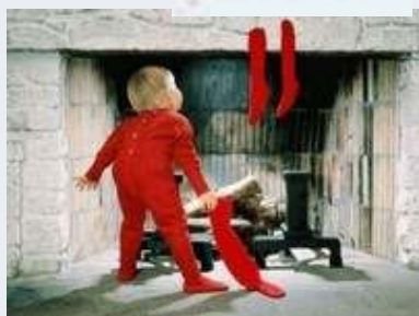
THIS IS ANTICIPATION