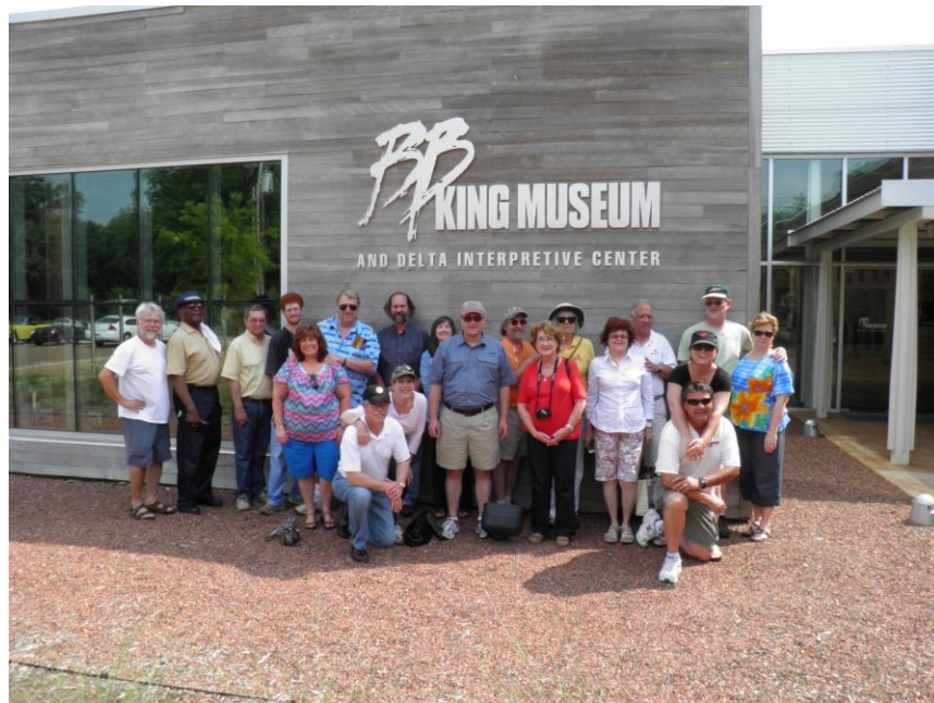
The EMC Gathering at the B.B. King Museum

Whilst lifting the bonnet I was checking off the list of possibilities. All coolant hoses were replaced slightly more than two years ago. An inspection of the engine bay this morning found all was well so this must be the radiator or the water pump, either of which would ground me for the weekend. I was staring disaster in the face.