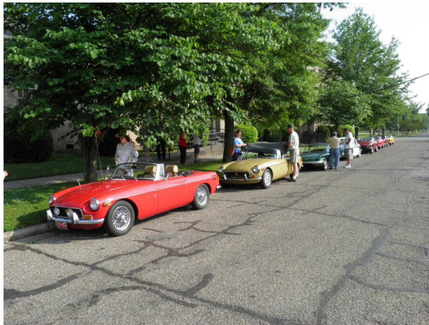
LBCs at the 1927 Flood Museum

Greenville was once a prominent port town, built on the highest point between Memphis and Vicksburg. In the 1940s and 50s Nelson Street, its vibrant club scene the home of jazz, blues and big bands, was the equal to Memphis’ still active Beale Street.